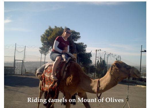
Riding camels on Mount of Olives

outlets there. You will need a CONVERTER and a plug adapter for Israel (available in luggage stores). The adapter plug provides a way for your appliance (curlers, hair dryer, shaver, etc.) to fit the supply of electric that is channeled through the Converter. Most times you get adapters for several countries when you buy the converter. Radio Shack has sets with all of the above. Note: Buy 1600 watts to handle the hair dryer and curler sets. Anything less than the 1600 watt type may burn out. If your converter is the type that uses a fuse, take spare fuses. CAUTION: Many tour members report problems with electric converters and adapters that are purchased at Radio Shack. Be aware.